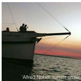
'Alfred Nobel' sunset cruise